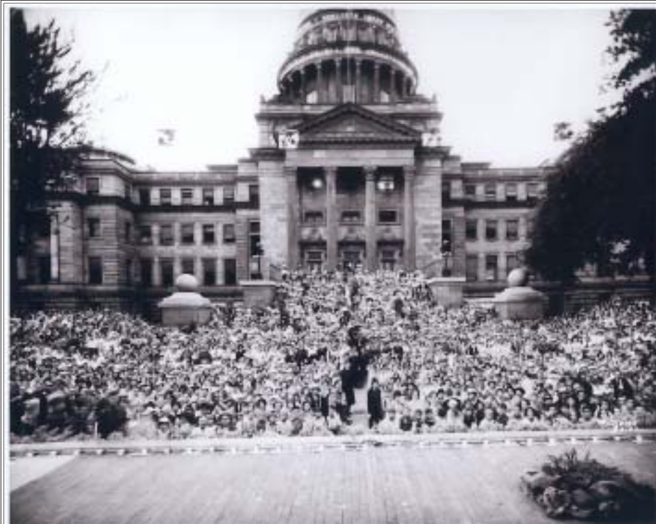
Early photo of the crowd gathered to watch the festivities on stage. Picture taken from the stage constructed in front of the Capital building.