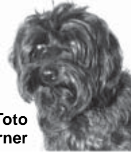
Toto Lucy Turner