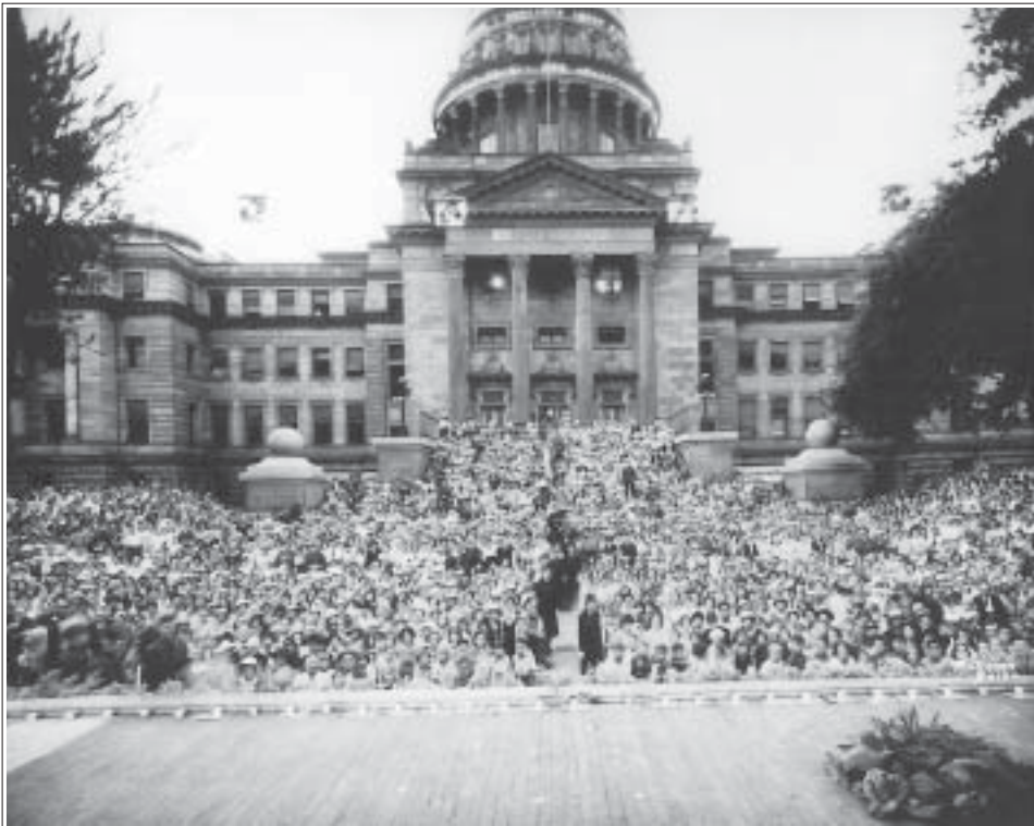
Early photo of the crowd gathered to watch the festivities on stage. Picture taken from the stage constructed in front of the Capital building.