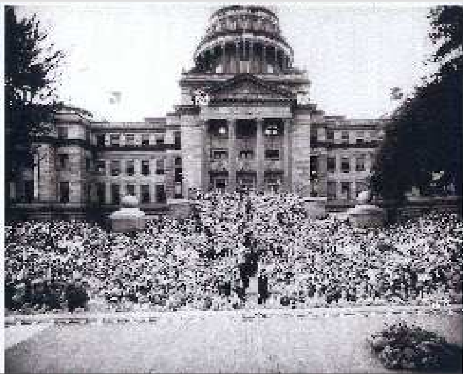
Early photo of the crowd gathered to watch the festivities on stage. Picture taken from the stage constructed in front of the Capital building.